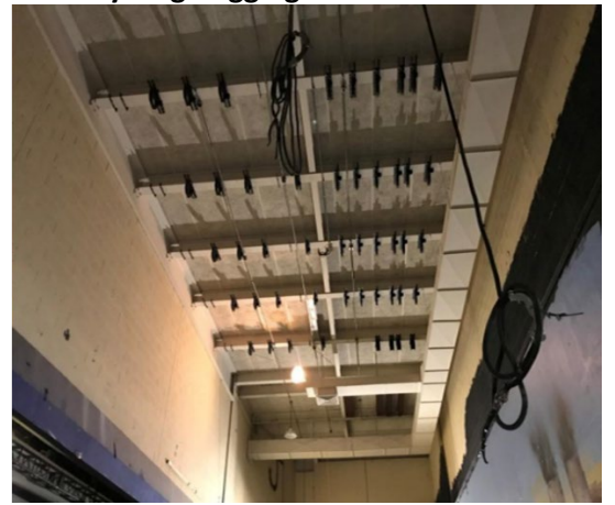
Removal of the old wood platform at John Jay New duct work installation at JJ auditorium