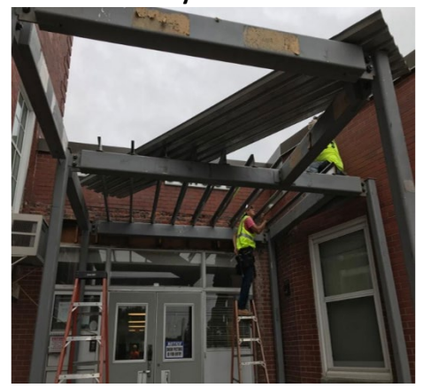
Fishkill's security vestibules